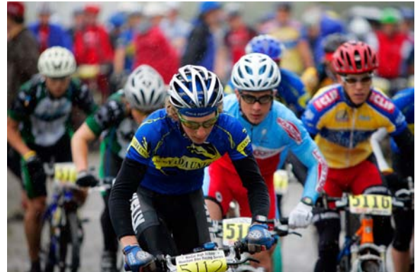
More info about the League is available at www.norcalmtb.org

The Tour of California begins in San Francisco on February 18th see a full schedule and stage details at www.tourofcalifornia.com .